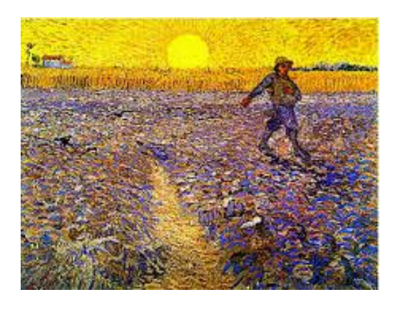
"A farmer went out to plant some seeds"