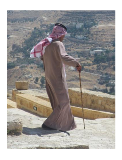
Different cultures ... same spiritual needs

"For yours is the kingdom, and the power, and the glory, forever." This doxology , or brief hymn of praise, was from 1 Chronicles 29:11.