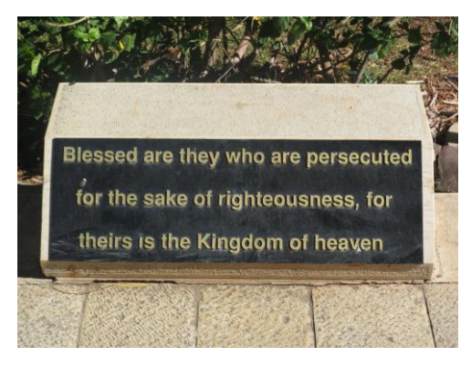
On the Mount of the Beatitudes