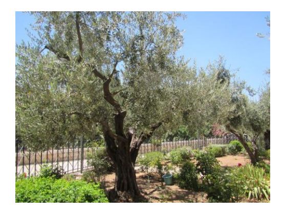
Olive Tree in Garden of Gethsemane